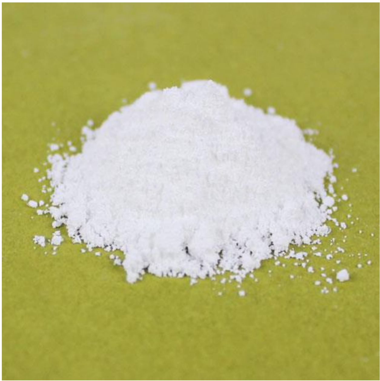
Oatmeal Milk and Honey Fragrance Oil